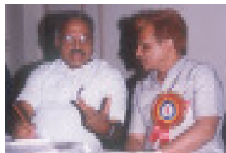
Our Chairman with Mr. P.J. Kurian, the then Union Minister & Chairman, IIT Delhi