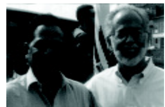
Our Chairman with Prof. Robert S. Pindyck, MIT, USA