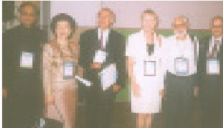
Finance India invited Strategic Partner along with "The Economist" & "Business Week" for Global Forum Management Education 2002 Conference, THAILAND