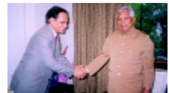
Our Chairman with Dr. Suraj Bhan, the then Governor of Himachal Pradesh