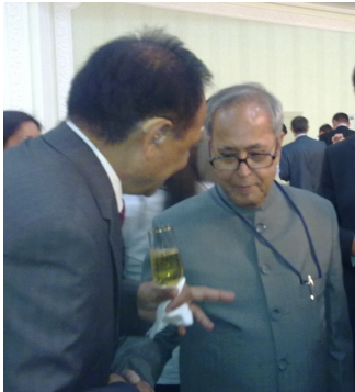
Our Chairman with Mr. Pranab Mukherjee, President of India, the then Finance Minister of India at ADB Annual Board of Governor's meeting, VIETNAM

The students run 'Eminent Speaker Lecture Series' by inviting leaders of business, industry & government to express their views on the major challenges facing business and industry today. Recent guest speakers include: